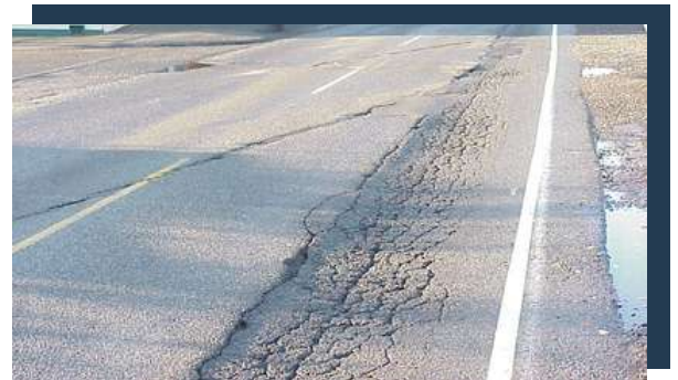
Uneven Road Settlement