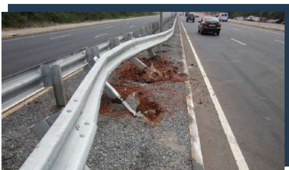
Damaged or Missing Barricades