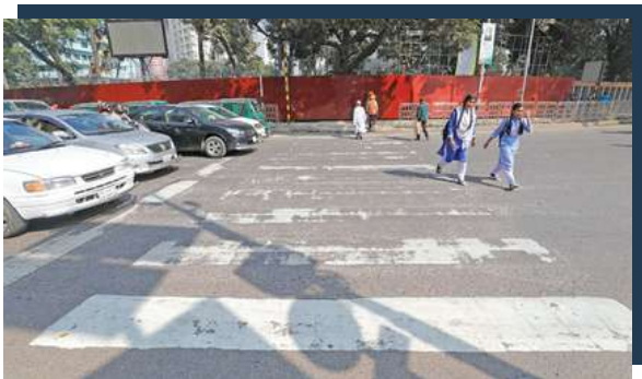
Fading Road Surface Signs